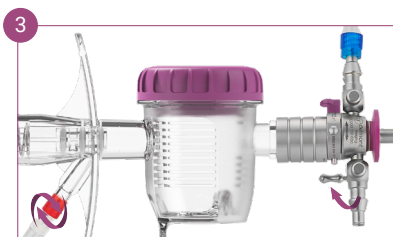
Close the stopcock and move the suction tube to the back