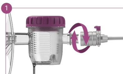
Connect ICE to its inner sheath

1 Schenker JG. Intrauterine adhesions: an updated appraisal. Fertil Steril. mai 1982;37(5):593-610